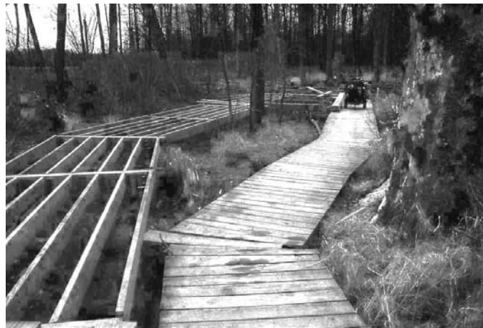
New Boardwalk Being Build Adjacent to Old