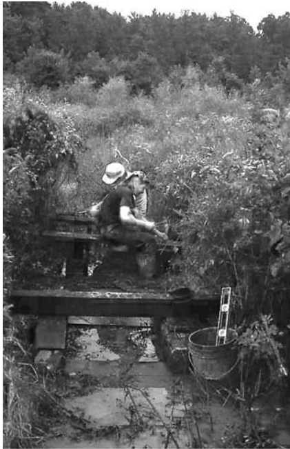
YACC Building Boardwalk

nal boardwalk began in 1979 and was completed in 1982. Gary's young crew thought he was crazy building a boardwalk over what was, at that time, dry land. But Gary had vision and he noticed the signs of increased beaver activity. Gary and his crew weren't the only construction crew in the wetland!