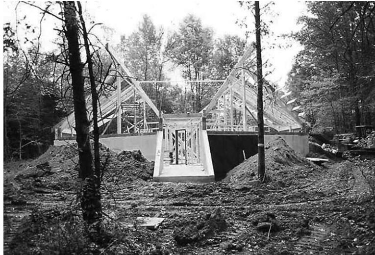
Framing of the First Visitor's Center